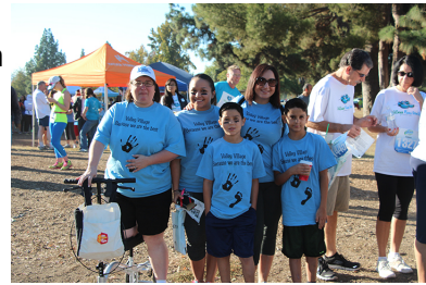
Valley Village Staff and Little Volunteers

We need your help in advance of the event too. Our Community Outreach Committee will be spreading the word to race participants, sponsors and the community. If you like to meet people and share information about important causes, this is perfect for you. Much of the work can be done from your home and in your community. We invite you to the initial meeting of this dynamic group on Wednesday, Sept. 23, at 5 pm at Valley Village , 20830 Sherman Way, Winnetka CA 91306. Please let us know if you can attend. Even if you can't make this meeting, you can still be a vital member of this dynamic team. Just sign up here.