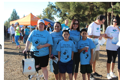
Valley Village Staff and Little Volunteers

We need your help in advance of the event too. Our Community Outreach Committee will be spreading the word to race participants, sponsors and the community. If you like to meet people and share information about important causes, this is perfect for you. Much of the work can be done from your home and in your community. We invite you to the initial meeting of this dynamic group on Wednesday, Sept. 23, at 5 pm at Valley Village , 20830 Sherman Way, Winnetka CA 91306. Please let us know if you can attend. Even if you can't make this meeting, you can still be a vital member of this dynamic team. Just sign up here.