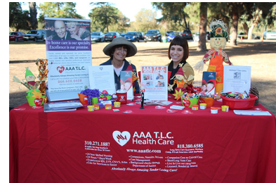
AAA TLC Health Care Booth at the 2014 Village Run/Walk