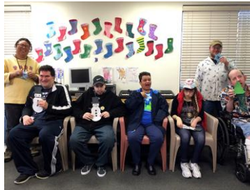
Our clients wish you all a happy holiday season.

Clients in our After-School Program send their best wishes as they display their snowmen and their stockings, part of their all-out preparations for the holidays.