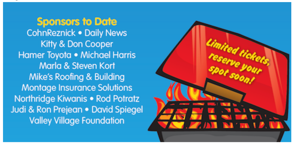
Don't Miss the June 28 Event

Civic leaders, friends of Valley Village and community members will gather at the Hidden Chateau & Gardens to enjoy sumptuous barbecue fare while saluting the retired City Councilman and aiding a worthy cause. Drawings and a silent auction will add to the festivities. Proceeds will aid our programs and services for adults with developmental challenges.