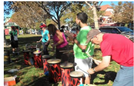
Wahlbangers Drum Circle

8:00-Noon Family Festival with music, food, information, samples, entertainment kids activities, raffle and more