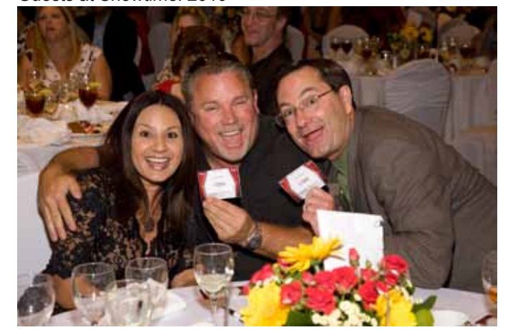
Guests at Showtime! 2010

Individuals and businesses interested in providing sponsorship for the event or in advertising in our special 40<sup>th</sup> Anniversary Program Book should also contact us by phone at (818) 587-9450 ext.120 or by email us at showtime@valleyvillage.org.