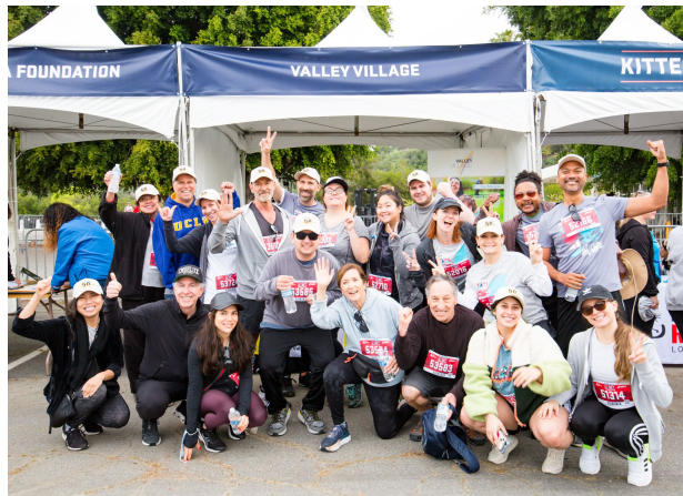
Team Valley Village poses for a picture before participating in the 2022 LA Big 5K.